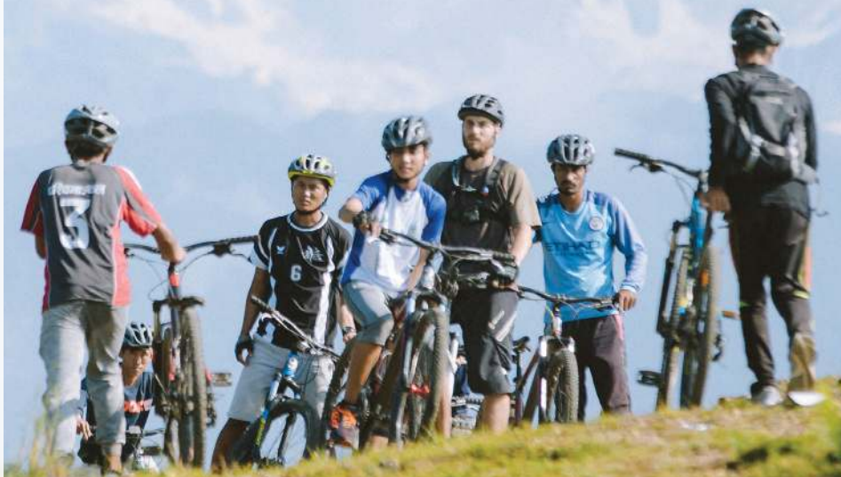
Photo: Mountain Biking program in Pokhara

The stories in these pages wouldn't be possible without your faithful support, which brings hope and transformation every day. We're grateful for your encouragement and generosity last year! Your big-hearted partnership brought disadvantaged children in the Himalayas from a place of not life to life. So thank you for the part that you play in making these programs flourish.